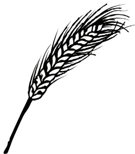
HOME GROWN BARLEY

At The Balvenie we stay true to our Five Rare Crafts, making whisky the way we always have. Our craftsmen have an intimate understanding of their materials and a desire to make the very best whisky possible. Our process is a combination of expertise, skill and ambition which gives The Balvenie its unique character.